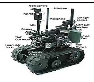
Figure 1. Robots in Combat Zone (Xuanzun, Global Times 2022) and Unmanned Land

Vehicles (ULVs)