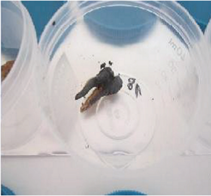
Figure 2. Color change in teeth exposed to high heat