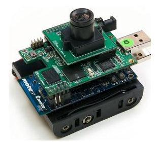
Figure 5. CITRIC

It is a camera network system [71] developed that supports in-node processing thereby reducing communication overheads. It has frequency-scalable (up to 624 MHz), 16 MB of flash and 64MB RAM.