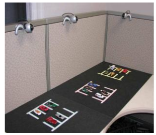
Figure 2. IrisNet platform

This is a two-tier testbed platform composed of Sensing Agents (SAs) and Organizing Agents (OAs). IrisNet uses aggressive filtering, smart query routing and semantic caching to amazingly reduce bandwidth utilization in the network and also improve query response time.