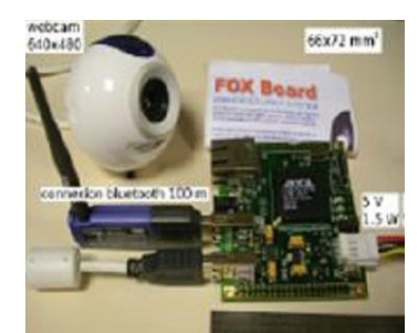
Figure 7. Sensor implemented using the fox board.

This [73] was developed by acme systems with providing high quality image transmission as the main purpose. Bluetooth is used for transmitting the images captured.