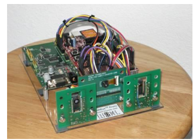
Figure 4. MeshEye mote

This was designed for surveillance applications with high energy efficiency as a target. It provides support for in-node processing and multiple resolutions [69-70].