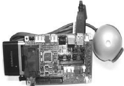
Figure 6. Panoptes

Panoptes [72] is a low power good quality video sensor platform. It supports video filtering, streaming, compression and capturing.